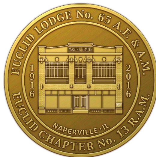
Reverse side of medallion