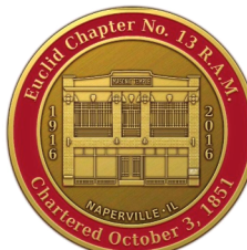
Chapter Lapel Pin