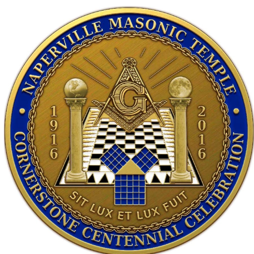
Obverse side of medallion

The medallion is 2 inches in diameter and will come inside a clear plastic capsule. The lapel pins are 3/4 inches in diameter. Medallion and lapel pins are shown larger than actual size.